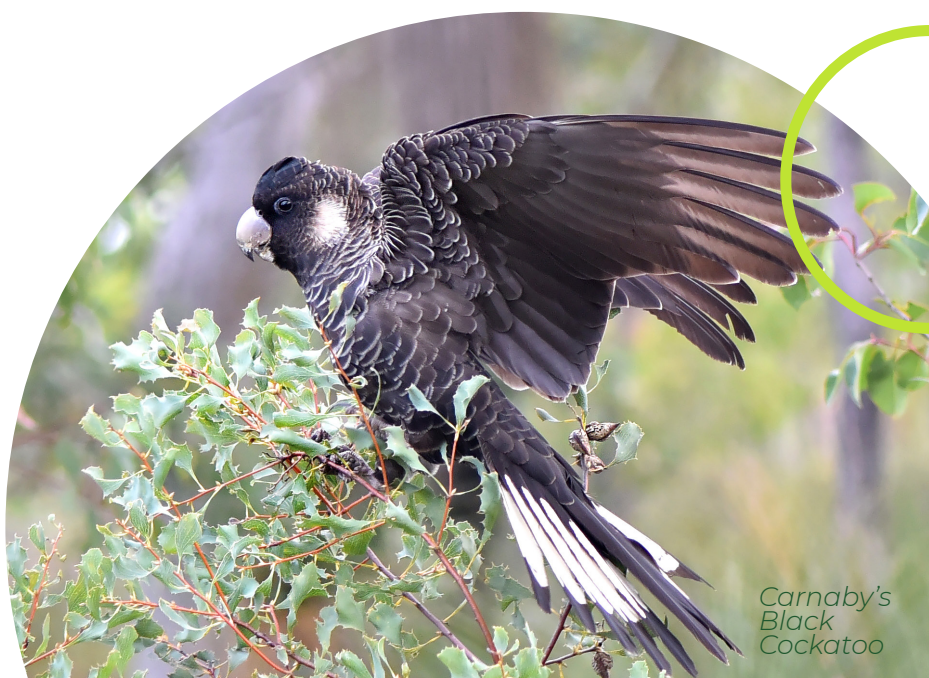
Carnaby's Black Cockatoo